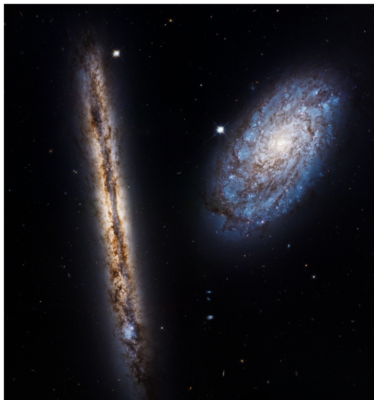
NGC 4298 (right) and NGC 4302, two interacting galaxies in Coma Berenices.